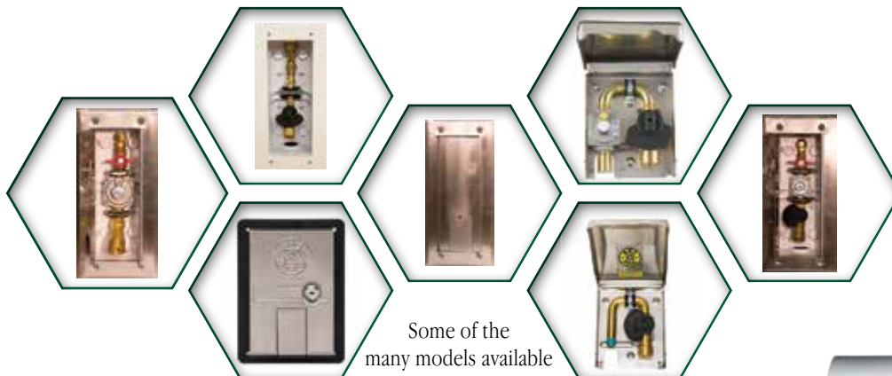
Some of the many models available