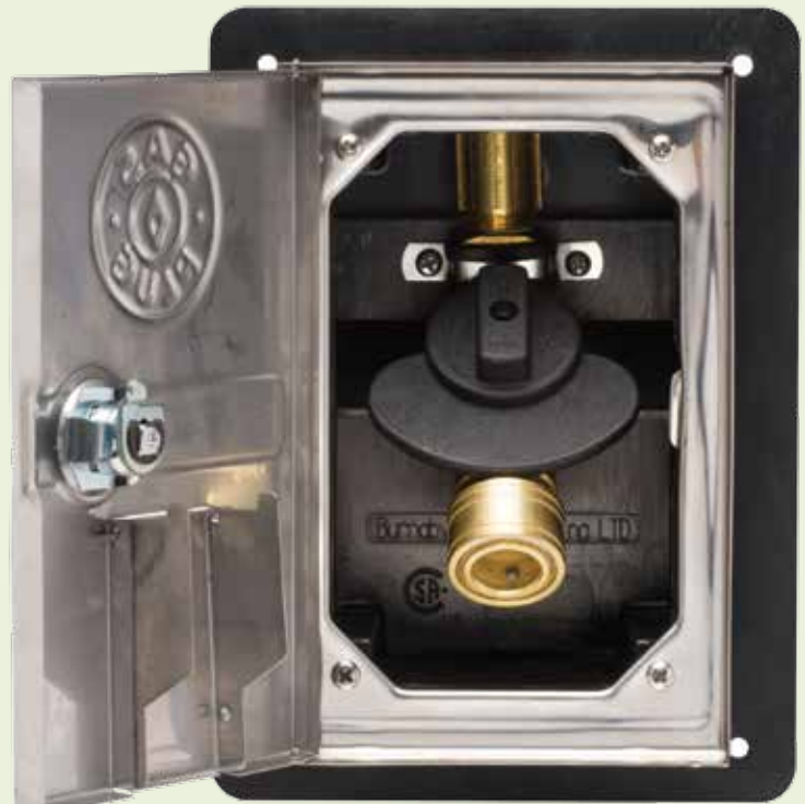
Convenience outlets offer flexibility for portable outdoor gas appliances, allowing a homeowner to plug into the home's natural gas supply in the same way electrical appliances plug into an electrical outlet.